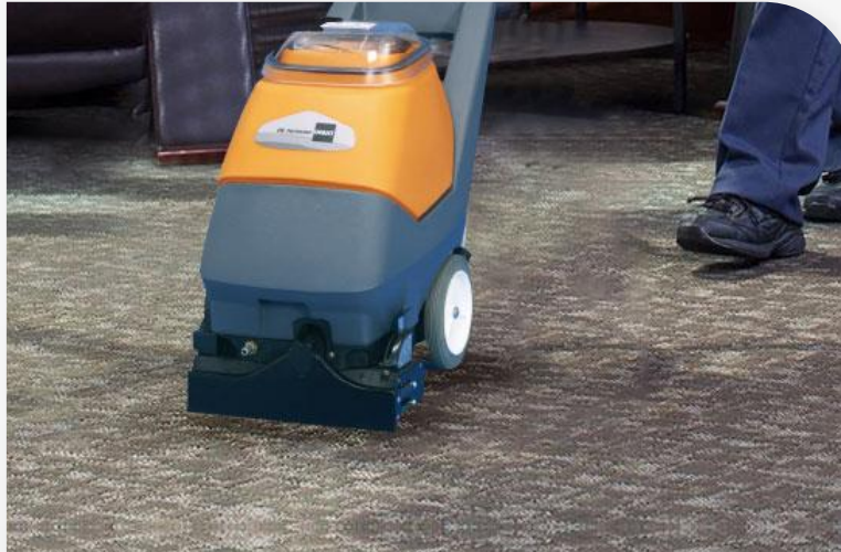
Carpet Injection Extraction Cleaning