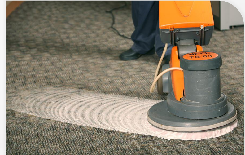
Carpet Shampoo Cleaning