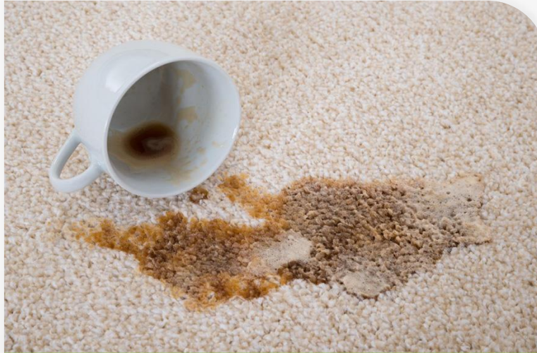
3M Scotchgard Treatment