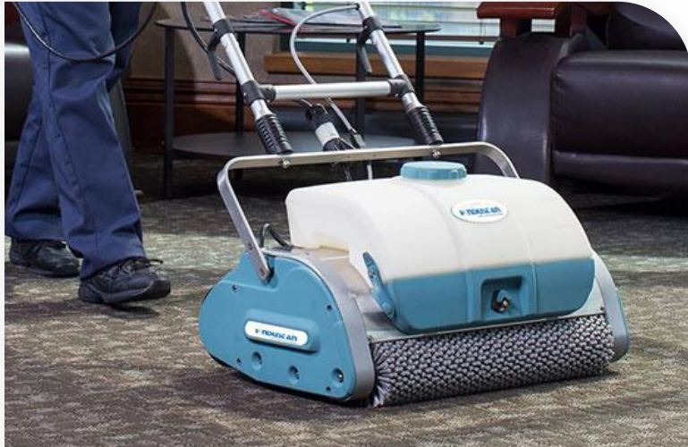
Carpet Encapsulation Cleaning